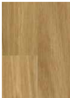
545 Eastern Blackbutt