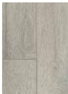
710 Ash Grey