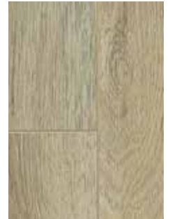
510 Tuscan Limestone