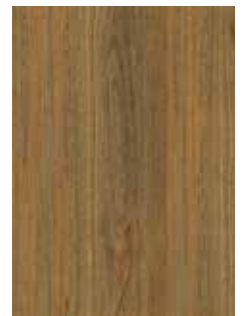
555 Spotted Gum