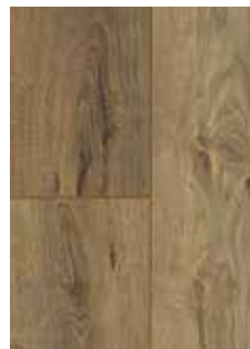
550 Tawny Brown