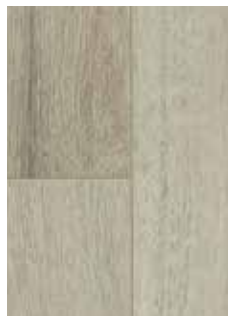
520 Light Taupe