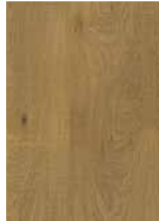
300 Nuttall Oak