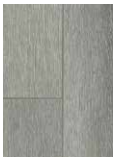
730 Timeless Grey