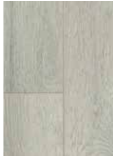
100 Whisper White