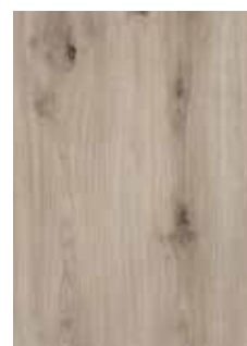
550 Tawny Oak