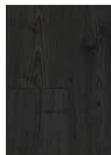
790 Wayward Oak

While all care is taken, product images may vary in colour due to possible printing process variations. Images are to be used as a guide only to give an idea of the colour and nuances of the pattern, but are not fully representative of the variations among the planks (which reflects the natural product which inspired the design). For a representative view of the surface structure and variations within the design, take a look at the big samples on display and ask your retailer for more advice.