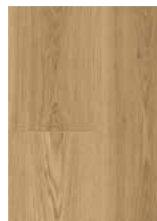
350 Harvest Oak