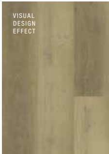
550 Aged Fumed Oak