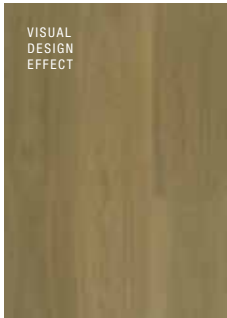
540 Natural Fumed Oak