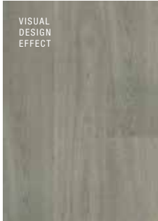
720 Reclaimed Oak