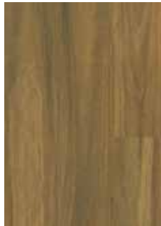
555 Spotted Gum