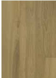
525 Alpine Gum